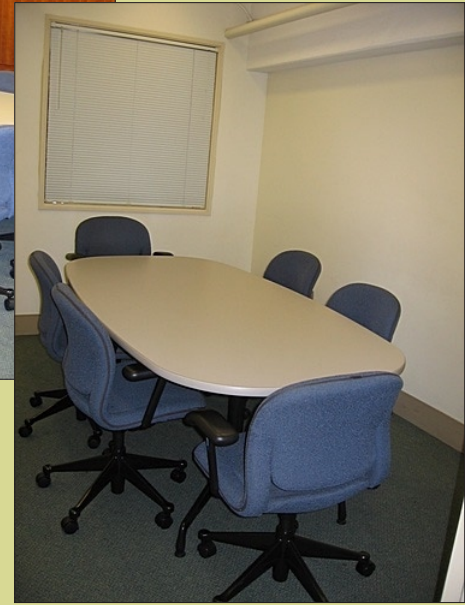
Small Conference Room